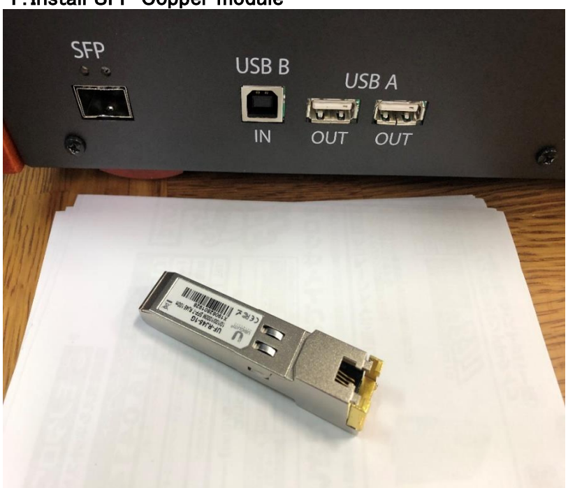
2:Insert the SFP Copper module into the SFP slot